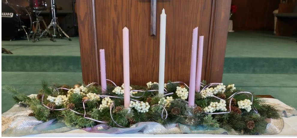
(Advent display by Bek Linsenmeyer)