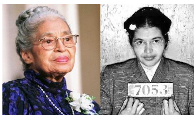
Three Things You Might Not Know about Rosa Parks